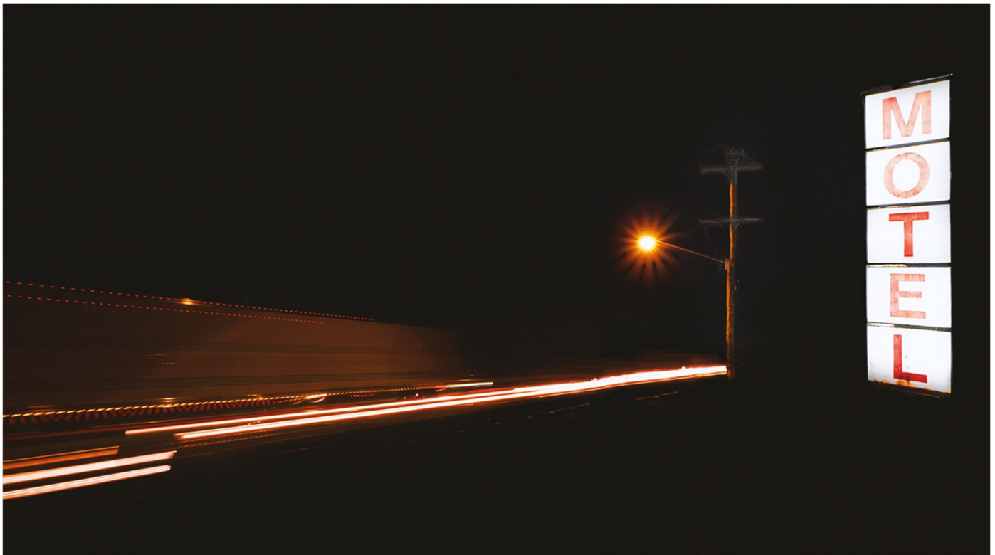
Rental Cars and Motel Rooms lead you everywhere but home