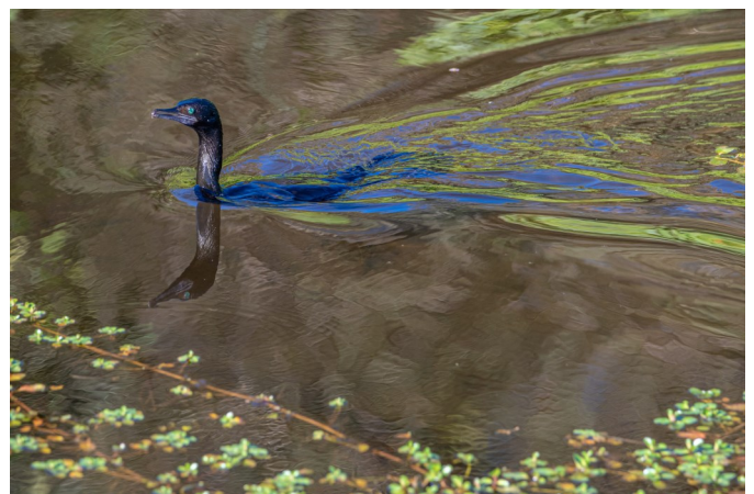
Article and images by Betty Collerson