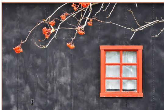
Framed-In-Orange by Peter-Moodie