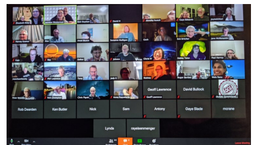
Eager ZOOM participants

24mm to 70mm; 70mm to 200mm; 100mm macro